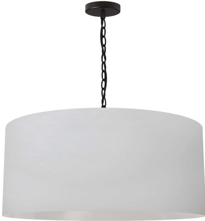
1 Light Large Braxton Black Pendant w/ White Shade